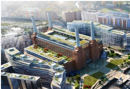
Battersea Power Station; London

Fulcro have a unique perspective of the Design and Construction industry, underpinned by digital technologies. We are an innovative and collaborative team that possess a unique set of skills honed through our 16+ years of experience, across all operational, organisational and delivery aspects of a project.