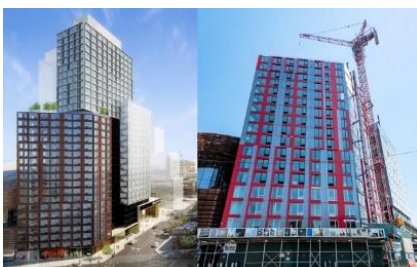
B2 Pacific Park ; New York