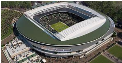
Wimbledon Court One; London