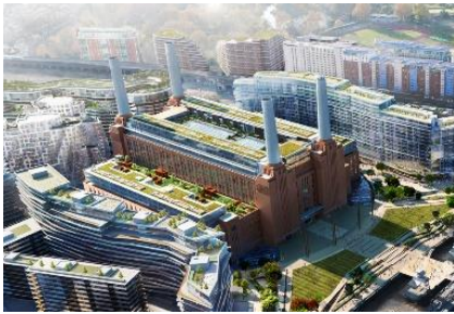
Battersea Power Station; London

Fulcro have a unique perspective of the Design and Construction industry, underpinned by digital technologies. We are an innovative and collaborative team that possess a unique set of skills honed through our 16+ years of experience, across all operational, organisational and delivery aspects of a project.