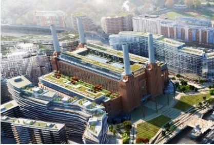
Battersea Power Station; London