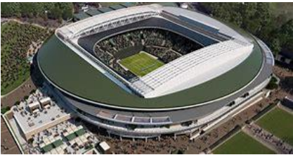
Wimbledon Court One; London