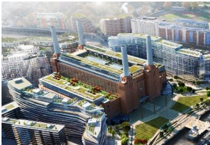
Battersea Power Station; London

Fulcro have a unique perspective of the Design and Construction industry, underpinned by digital technologies. We are an innovative and collaborative team that possess a unique set of skills honed through our 16+ years of experience, across all operational, organisational and delivery aspects of a project.