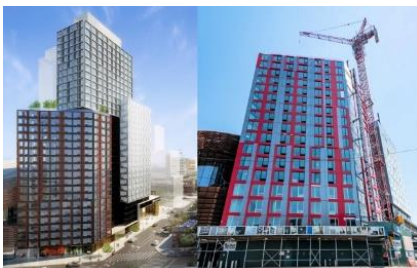
B2 Pacific Park ; New York